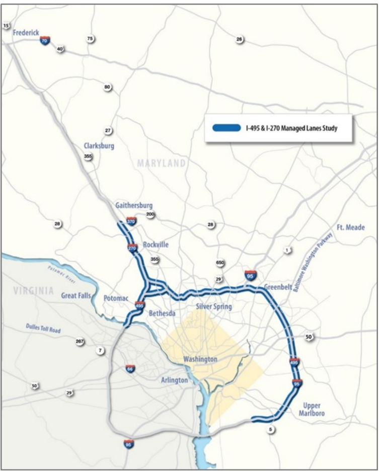
Figure ES- 1: I-495 & I-270 Managed Lanes Study Corridors

are carried to MD 5, a regional access controlled north-south highway, to be merged into the existing mainline lanes before the express-local system without causing congestion due to lane drops, weaving, and merging.